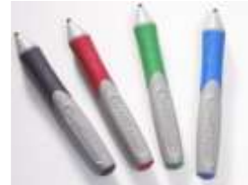
These are in a tin box inside the cabinet

(SMART board software must first be installed on your laptop. Contact Computer Resources)